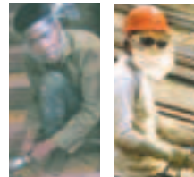
Some PPE seen on the internet.