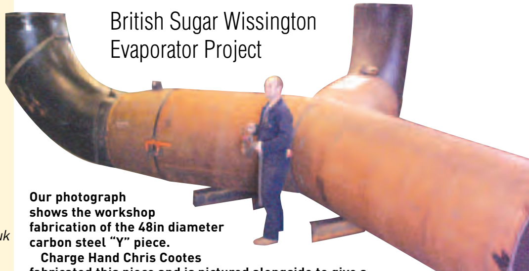
British Sugar Wissington Evaporator Project