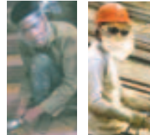
Some PPE seen on the internet.